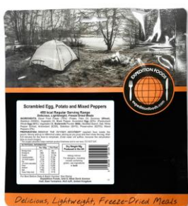
Table 4.1 below summarises Expedition Foods base (450 kcal Regular Serving) offering.

Established 1995, Expedition Foods supplies freeze dried foods to explorers, sailors, campers etc. internationally. Their meals come in 3 sizes, 450kcal (Regular Serving), 800kcal (High Energy Serving) and 1000kcal (Extreme Energy and Regular Meal for Two). They sell their own brand directly online. Their freeze-dried brand is quoted as 5 year shelf life. The pouches come with oxygen absorbers which must be removed before re-hydration (are they not nitrogen packed?).